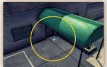
4 In the Musso & Frank back parking lot. Look on the ground at the back door.