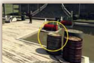
9 Atop a barrel on the ducky paddleboats pier in MacArthur Park.