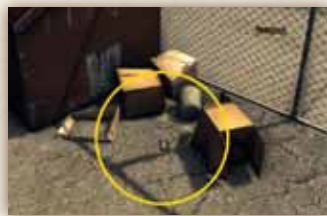
3 Beside the trash in the corner of the small fenced-in lot next to the Max Factor Building. Jump the fence or drive a car through the back gate to reach it.