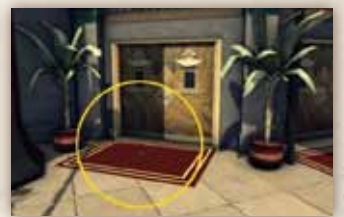
2 Face Grauman's Theatre from Hollywood Blvd, then walk down the red carpet toward the main entrance. Stop at the doorway and turn left to find this shield on the doormat.