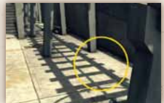
14 Beneath the Angel's Flight incline railway. Look under the track at the lower end of the line.