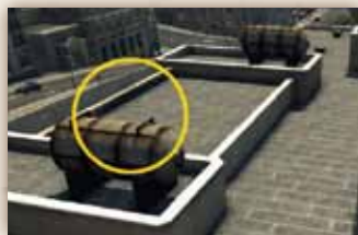
15 Climb the gutter on the northwest corner of the LA Public Library, then scale the scaffold on the next ledge to reach the rooftop. Head to the front of the building (northeast) and climb the platform between the two tank platforms to find the Shield near the edge of the roof.