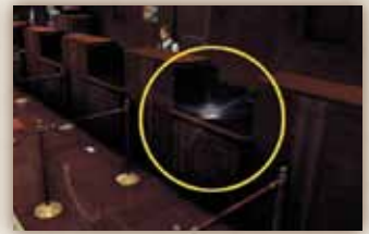
12 Inside Union Station, on the ticket counter at the Southern Pacific desk.