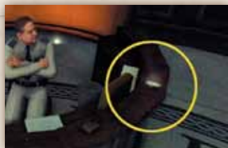
13 In the guard's booth on the first floor of the Hall of Records in Civic Square.