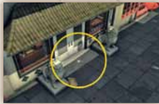
11 At a Chinese store just west of the Chinatown landmark. Look on the ground between two lion statues out front.