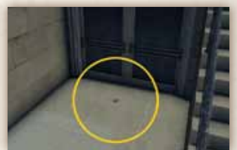
6 At the bottom of the exterior stairwell at the south entrance of the Bullocks Wilshire department store.