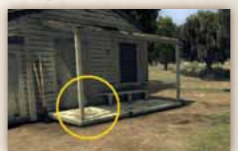
8 On the front porch of the shack facing the Westlake Tar Pits.