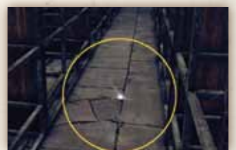
10 Below the skull stage, near the entrance of the Intolerance Set landmark. Enter the set through one of the arched doorways on either side of the stairs, then work your way around the backside of the stage to find the tunnel underneath. The Shield is in the middle of this passage, almost directly below the skull.