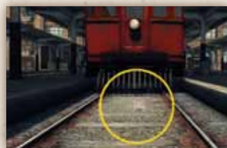
19 In front of the middle train on the train platform at the Main Street Terminal.