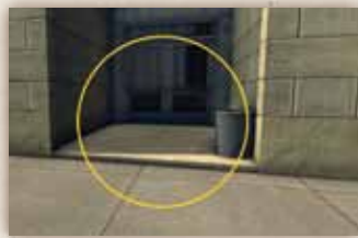
1 On the ground in front of the Hotel Roosevelt's north-facing doorway.