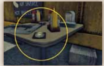
16 On the Trolley Dogs' condiments table in Pershing Square.