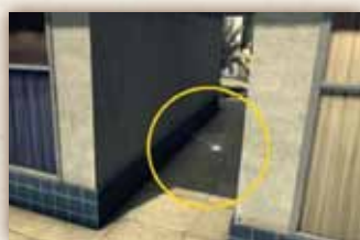
5 On the ground in the small alley between the two Crossroads of the World buildings.