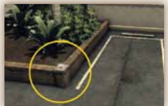
18 On the edge of the planter in the back parking lot of the Herald Examiner.