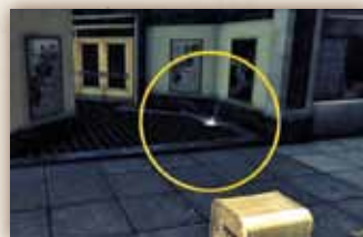
17 On the ground at the entrance of the RKO Theatre.