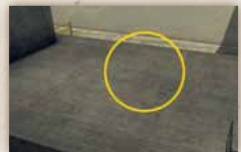
20 On a 6th Street bridge support platform. Drive down the slope between the parallel roads on 6th Street, starting at the Santa Fe Ave intersection. Follow the slope down to the flood control channel. Climb the ladder on the first support column as you enter the channel to find the Shield above.